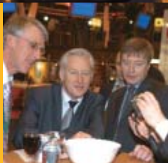
Conference Sessions - Waterfront Hall

BCSC Annual Conference Regenerating Communities Mon 1 - Wed 3 November 2004