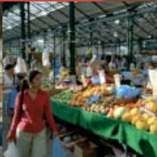
Retail Showcase – St. George's Market

Delegates will have time throughout the event to make the most of the exhibition. Make sure you don't miss out on some of the great social activities taking place within Retail Showcase.